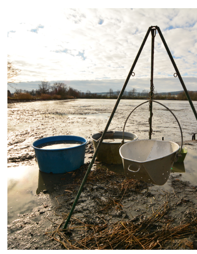
Research Institute of Fish Culture and Hydrobiology (FFPW USB Main building)

The CENAKVA Research Infrastructure is the research infrastructure which helps to create global trends in fisheries concerning to conservation of biodiversity of hydrocenoses in Europe. The main scientific objective of the centre is to fully understand the processes in freshwater ecosystems, protection of water environment and also the protection of water resources for life and human activities.