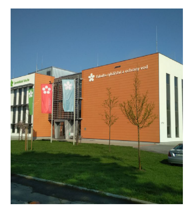
Educational facilities "ZR FROV JU"

Most of the theoretical and practical education of bachelor (Fishery, Protection of Waters) and master study programs (Fishery and Protection of Water) take place in the newly built modern facility "ZR".