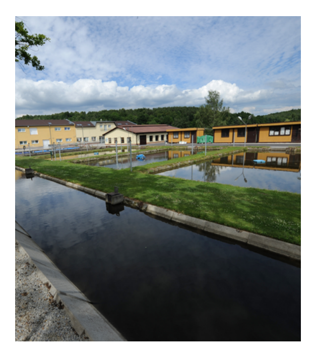
Genetic Fisheries Center

The purpose of the Genetic Fisheries Centre (GFC) is to preserve genetic resources of existing broodstock and populations of carp, tench, wels and sturgeons. Nowadays we are keeping 15 breeds and lines of common carp, 11 breeds plus three colour (golden, blue and white) varieties of tench and two breeds of wels. This Centre has been entrusted with leading the breeding and testing program of common carp and tench performance in the Czech Republic since 1982.