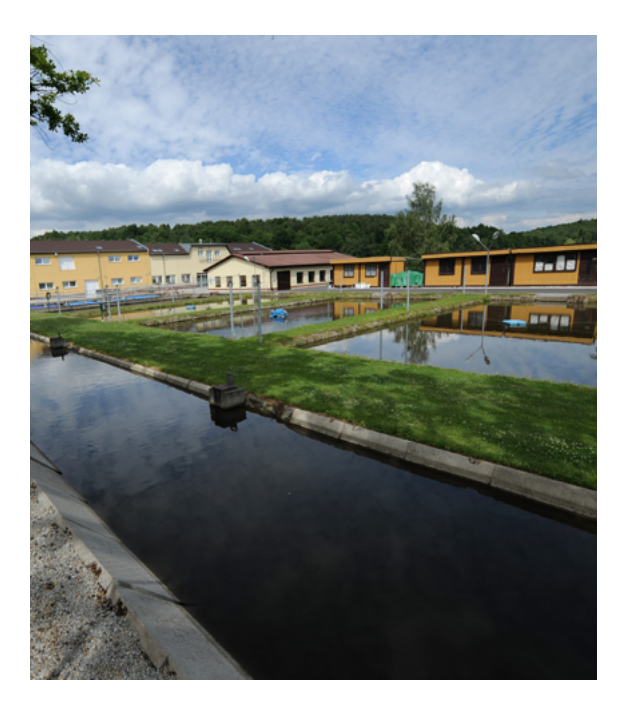
Genetic Fisheries Centre

The purpose of the GFC is to preserve genetic resources of existing broodstock and populations of carp, tench, wels and sturgeons. Nowadays we are keeping 15 breeds and lines of common carp, 11 breeds plus three colour (golden, blue and white) varieties of tench and two breeds of wels. We take pride in the successful breeding of 11 sturgeon species. This Centre has been entrusted with leading the breeding and testing program of common carp and tench performance in the Czech Republic since 1982.