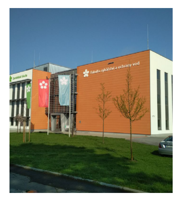
Educational facilities "ZR FROV JU"

Most of the theoretical and practical education of bachelor (Fishery, Protection of Waters) and master study programs (Fishery and Protection of Waters) take place in modern facility "ZR". There are laboratories that deal with a wide range of research and consulting activities in the areas of pond and intensive aquaculture, processing and fish quality, fishery in open