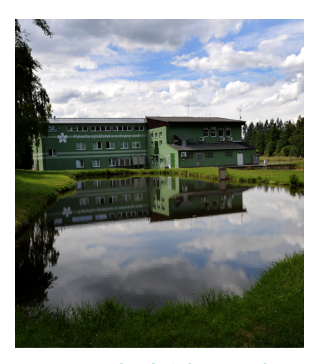
Experimental Fish Culture Facility

It consolidates a complex of 50 experimental ponds with a total area of nearly 7 ha and fish rearing facility equipped with flow through as well as recirculation systems primarily for keeping of early stages of various fish and crayfish species. In early 2013, the facility was updated by new rearing systems, a laboratory and teaching rooms. Further, a new outdoor gutter with 82 different tank types available for fish and crayfish has also been put into operation.