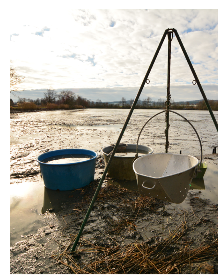
Research Institute of Fish Culture and Hydrobiology (FFPW USB Main building)

The CENAKVA Research Infrastructure helps to create global trends in fisheries concerning to conservation of biodiversity of hydrocenoses in Europe. The main scientific objective of the centre is to fully understand the processes in freshwater ecosystems, protection of water environment and also the protection of water resources for life and human activities.